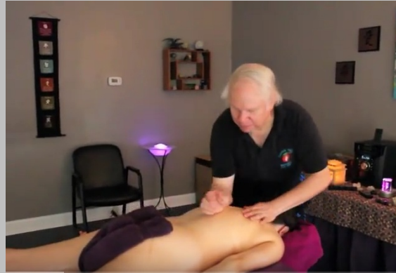
Hawaiian Temple Lomi Lomi (Click on picture to see video)