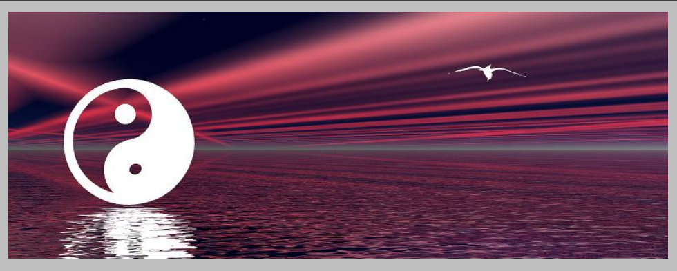
Caring Palms Promise

Brian is now doing readings to anyone that wants to sit for one for $40 for up to one hour. Keep in mind, these are mediumship readings, not psychic readings. If you have an interest, please contact Brian and something can be scheduled. These can also be scheduled from the website.