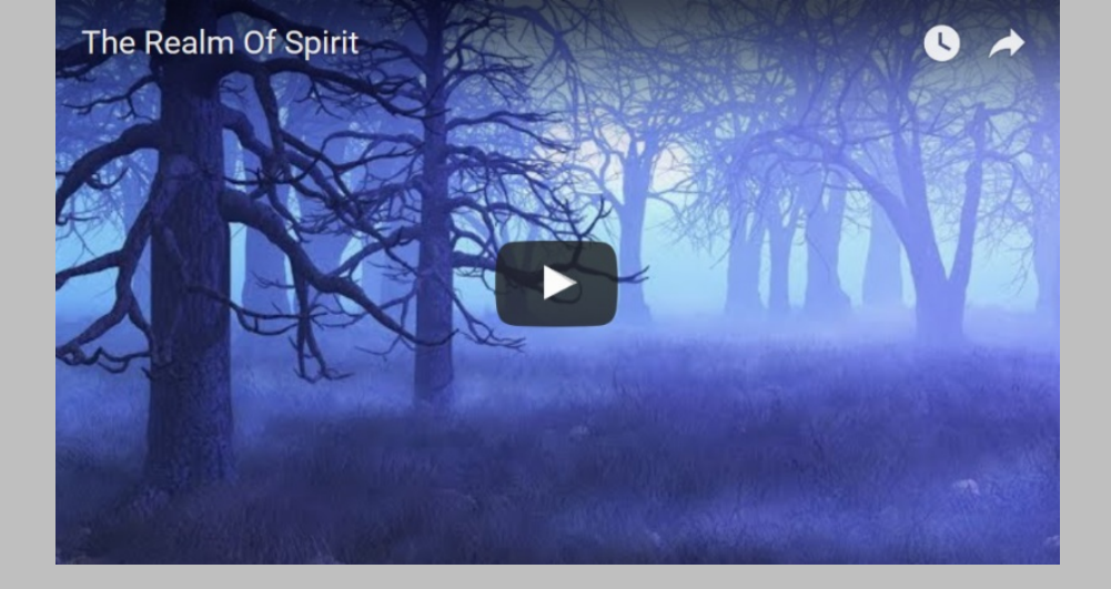
Select here or on the picture to view the video.