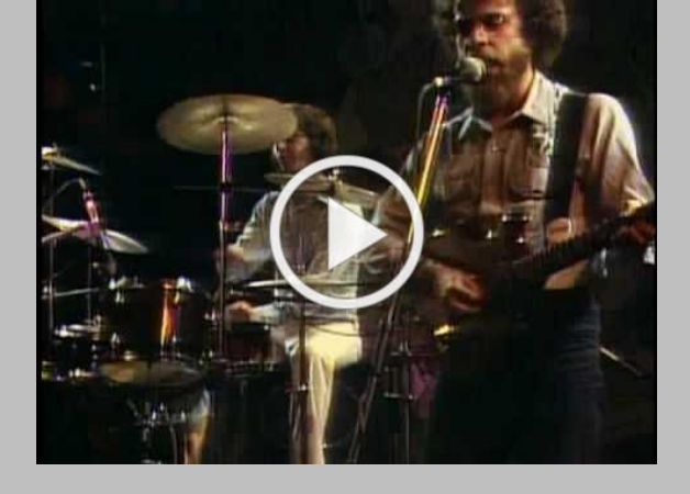
Circle - Harry Chapin, 1977